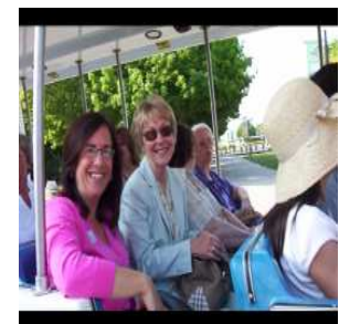
Fun at Brookfield Zoo, the Summer Networking Meeting

post or read of job opportunities in the Chicago area. You may post any job opportunity that is considered a lead or senior position, or is (continued page 2)